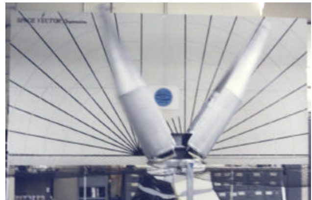
Nose Fairing Deployment Test at Space Vector