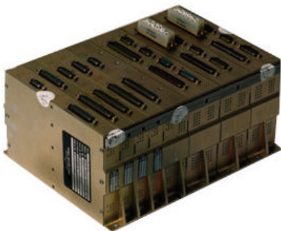
Vehicle Interface Unit

The two-stage (SR19/M57) Payload Launch Vehicle has just completed flight testing of critical interceptor system components in a series of 10 launches from the Kwajalein Missile Range (KMR) located in the Marshall Islands.