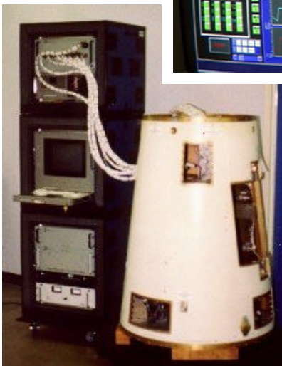
Testing of the Booster Adapter