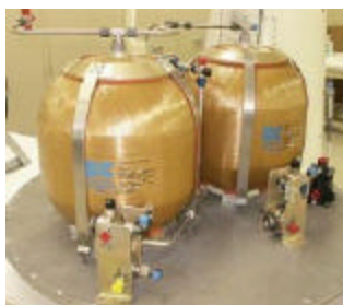
Reaction Control System